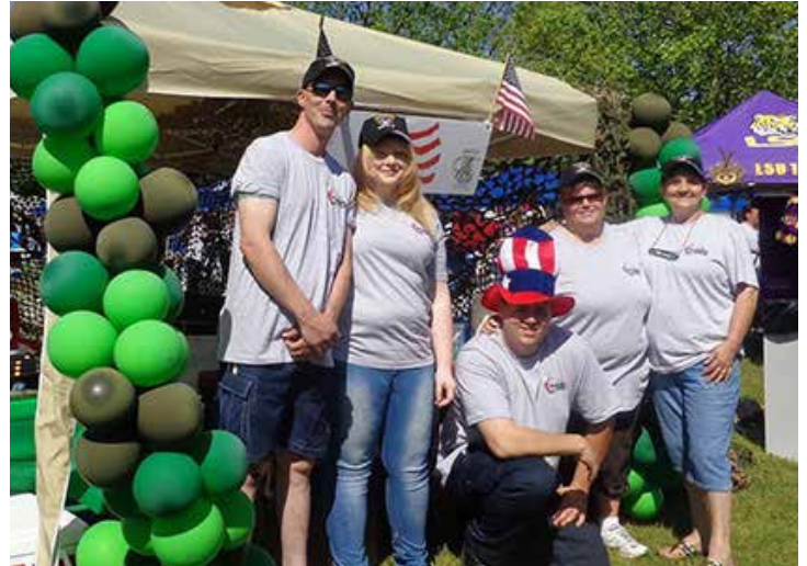
Three Hots and A Cot won the First Place Award for Best Specialty Gumbo (made with smoked duck and Andouille sausage.) The First Place Spirit Award for tent and table decorations went to the Apostles with Fire.